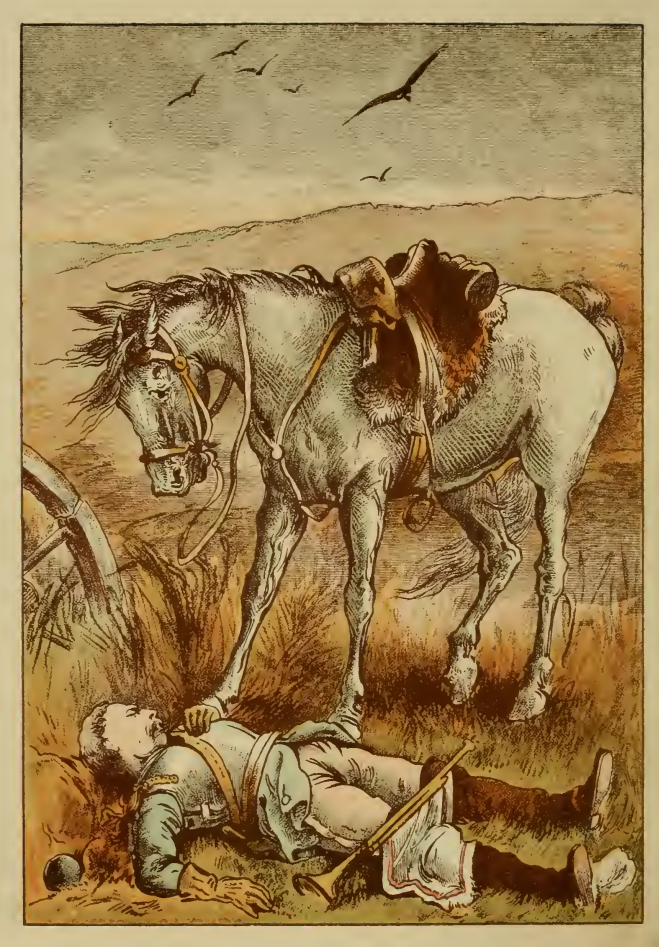
"THE HORSE STOOD SENTINEL OVER HIS BODY."